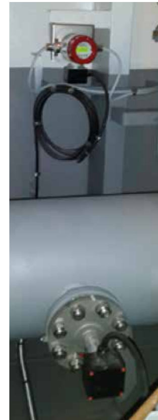
Installation after completion in cooling circuit of the “Three Gorges hydro-electric dam” (China)